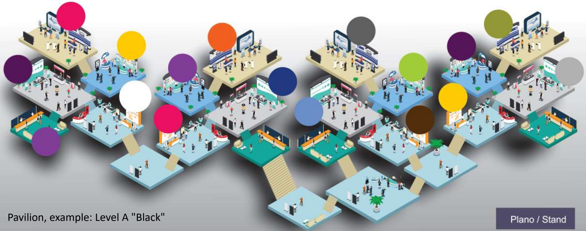
Pavilion, example: Level A "Black"

In the option "Stands" the visitor can either search for companies through their brand name, branch, keyword or click on the corresponding circle for the chosen brand in the map.